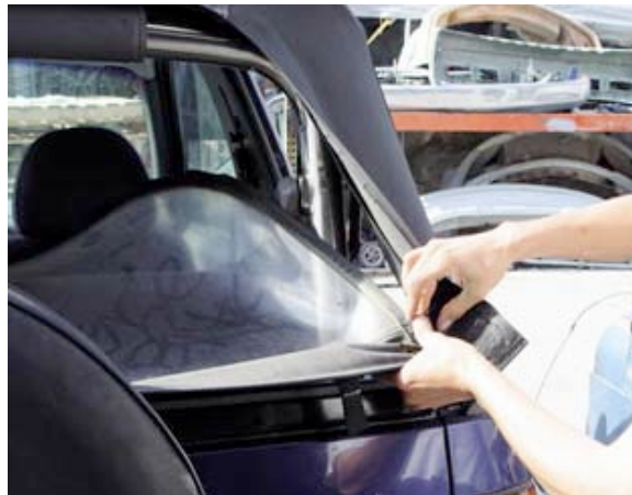
4. Remove rear window.