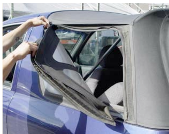
2. Remove side windows. (both sides)