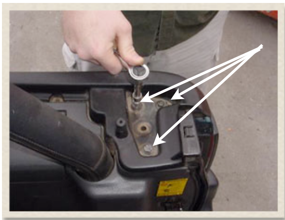
5. Remove the 3 bolts in the trim pieces. (both sides)