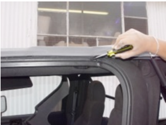
5. Pry open side connections with screwdriver.