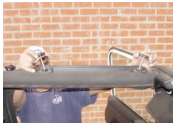
12. Unscrew door pins & remove frames.