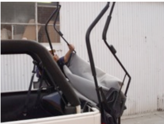
11. Remove soft top.