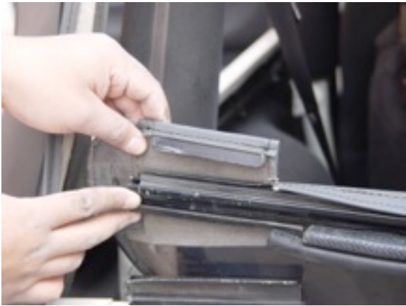
3. Pull back bar off and remove.