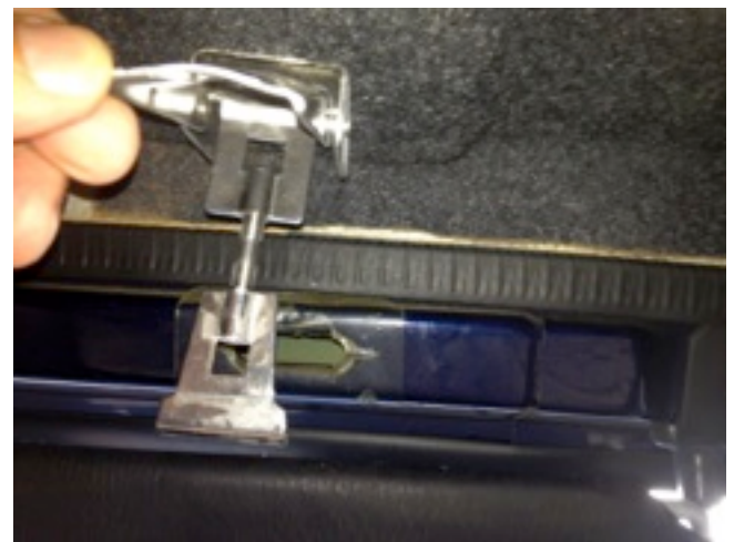
18. Adjust the cam locks to medium tension.