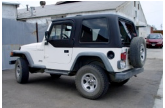
16. Skip to half door instructions. When they are installed then install hardtop on vehicle with at least 2 people.