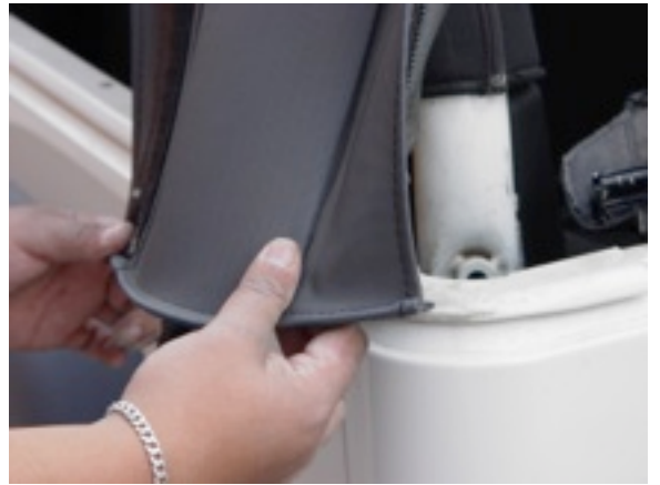
4. Pull down on corners and disengage.