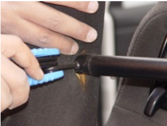
9. Remove bolt from soft top frame.