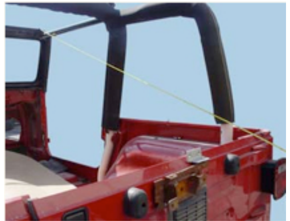
14. See pre-installation instruction sheet.