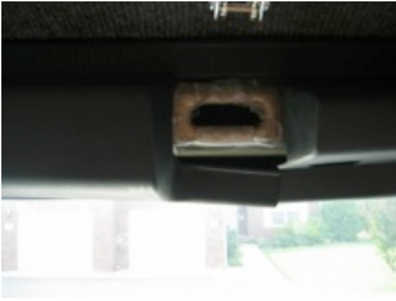
7. Disengage soft top from windshield.