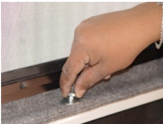
17. Install 6 bolts with washers using nut plates.