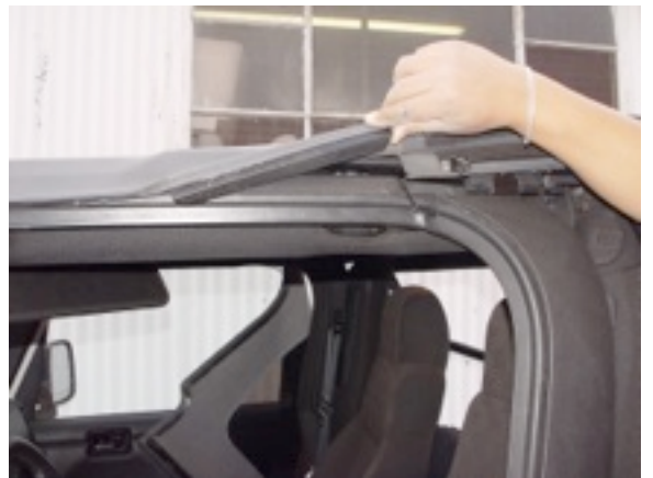
6. Remove side connections to door frame.