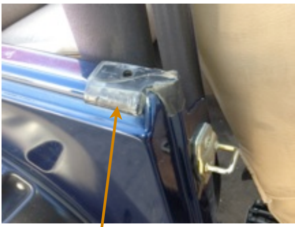
15. Do not remove end seal.