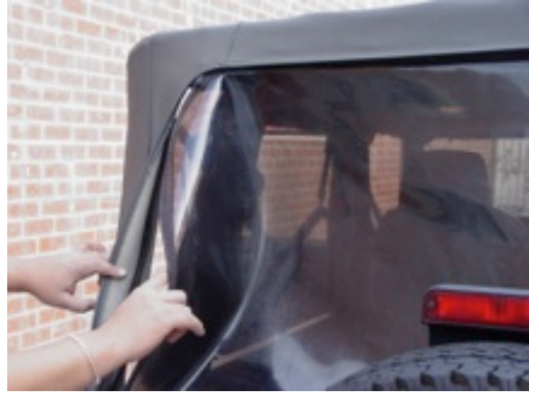
2. Unzip rear window and remove.