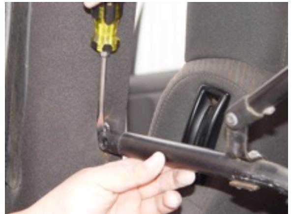
10. Pry off soft top frame from roll bar.