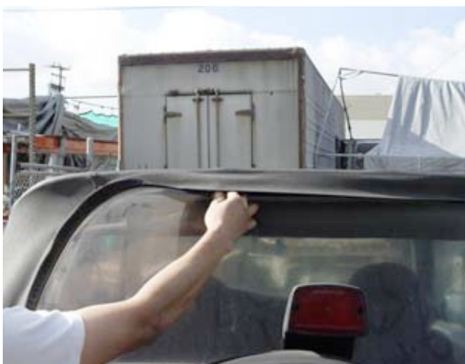
3. Unzip rear window.