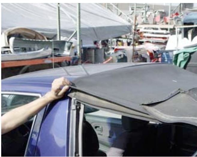
6. Pull forward to disengage soft top from front flange.