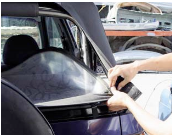
4. Remove rear window.