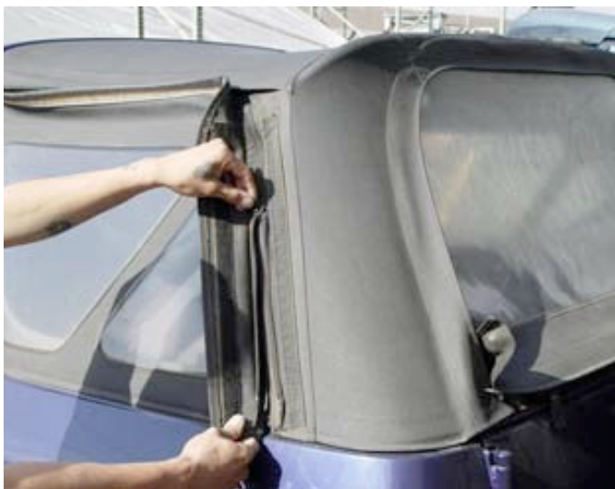
1. Unzip side windows. (both sides)