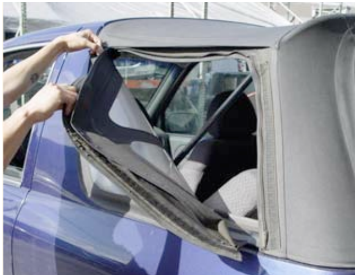
2. Remove side windows. (both sides)