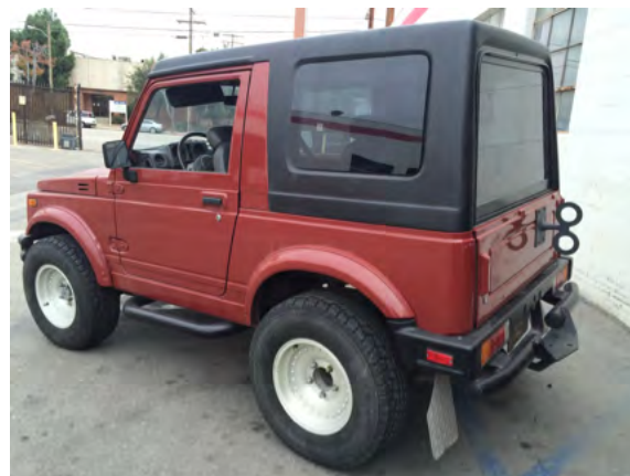
9. Your done. Enjoy!!!