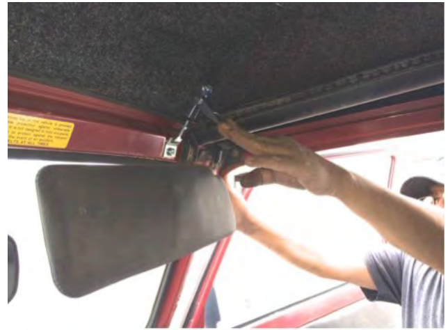
8. Engage the cam locks to medium tension.